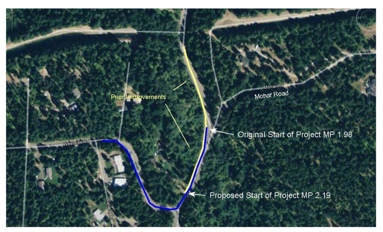
East end of project