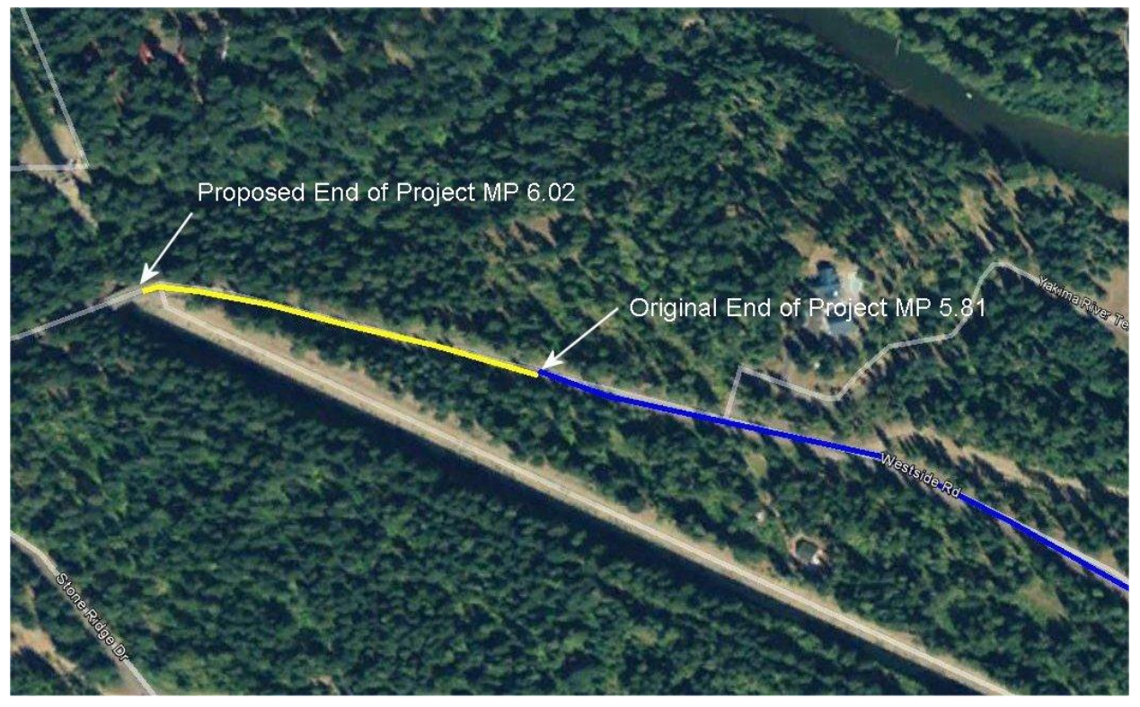
West end of project